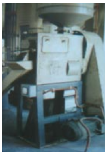
Plate 2. Friction polisher (control)