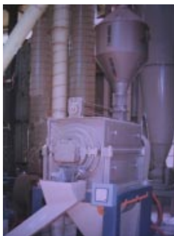
Plate 1. Humidified polisher (treatment)

MARDI Station, Bukit Raya. The studies were conducted during the off-season (November 1996) and main season (May–June 1997) respectively. The milling operations comprise cleaning, destoning, husking, separating of paddy and brown rice, whitening, polishing (friction or humidified), grading and packing. The polished rice was produced either from friction polisher or humidified polisher. The milled rice with loose bran from the whitening process was further polished by humidified polisher (as treatment), Plate 1 or friction polisher (as control), Plate 2 .